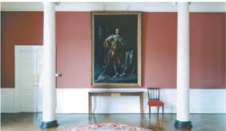
Candida Höfer, Irish Museum of Modern Art Dublin I , 2004, 180 x 220 cm, Courtesy of the artist and VG Bild-Kunst