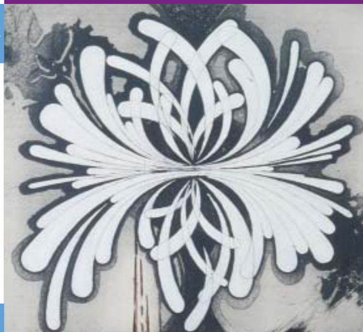
Micheal Farrell, Une Nature Morte a la Mode Irlandaise , (detail) 1974, Acrylic on paper, 73.66 x 73.66 cm, Collection Irish Museum of Modern Art, Heritage Gift, P.J. Carroll & Co. Ltd. Art Collection, 2005