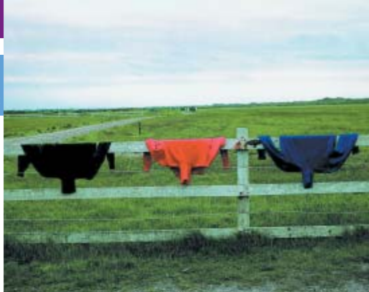
Orla Barry, Brothers , from the series Portable Stones , 2004, Photograph mounted on aluminium

NEW GALLERIES & GORDON LAMBERT GALLERIES, WEST WING, GROUND FLOOR