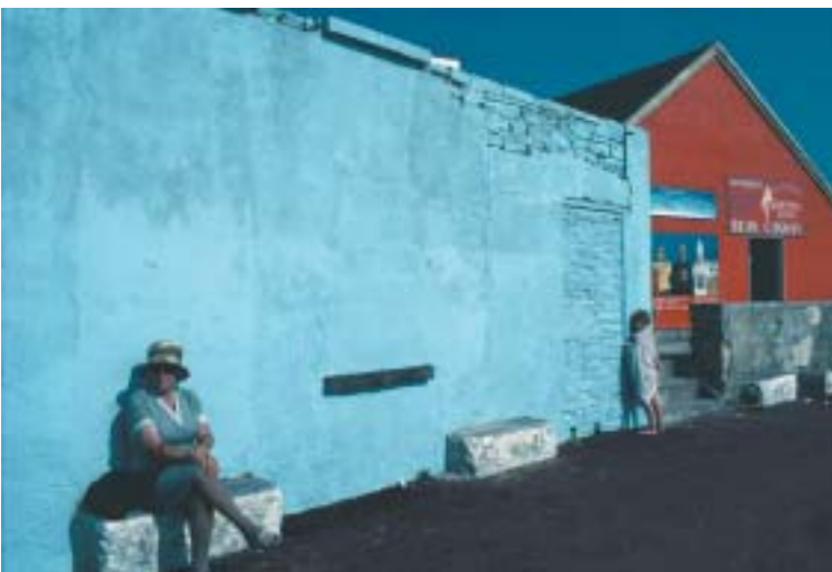
Harry Gruyaert, County Kerry, 1983

Magnum Ireland includes more than 140 photographs taken in Ireland since the 1950s by some of the world's leading photographers, including Henri Cartier-Bresson, Elliott Erwitt, Martin Parr, Josef Koudelka, Inge Morath, Erich Lessing and Eve Arnold, all members of Magnum Photos international co-operative of independent photographers. The exhibition presents an evocative and arresting visual history of Ireland, North and South, with particular emphasis on the strong influence of rural life in the earlier decades, the Northern Troubles of the 1970s and '80s, and the rapidly-growing confidence and prosperity of the past decade. Many of the images have not been seen before.