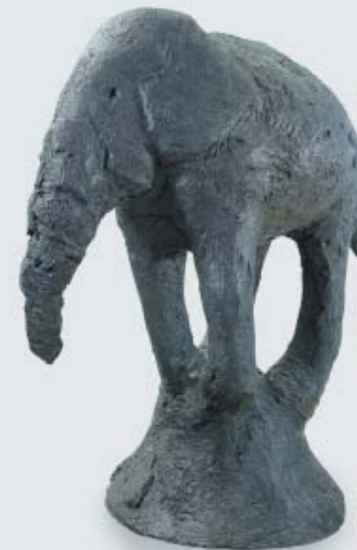
Barry Flanagan, Elephant , 1986, bronze, 1030 lb / 468 kg, edition of 7 & 1 artist's cast, 196.2 x 188 x 105.4 cm. Courtesy Waddington Galleries, London.