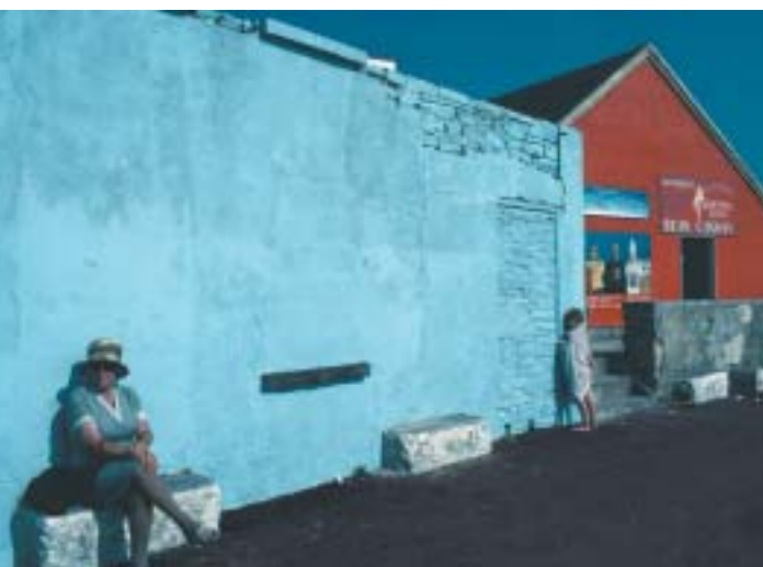
Harry Gruyaert, County Kerry, 1983

Magnum Ireland includes more than 140 photographs taken in Ireland since the 1950s by some of the world's leading photographers, including Henri Cartier-Bresson, Elliott Erwitt, Martin Parr, Josef Koudelka, Inge Morath, Erich Lessing and Eve Arnold, all members of Magnum Photos international co-operative of independent photographers. The exhibition presents an evocative and arresting visual history of Ireland, North and South, with particular emphasis on the strong influence of rural life in the earlier decades, the Northern Troubles of the 1970s and '80s, and the rapidly-growing confidence and prosperity of the past decade. Many of the images have not been seen before.