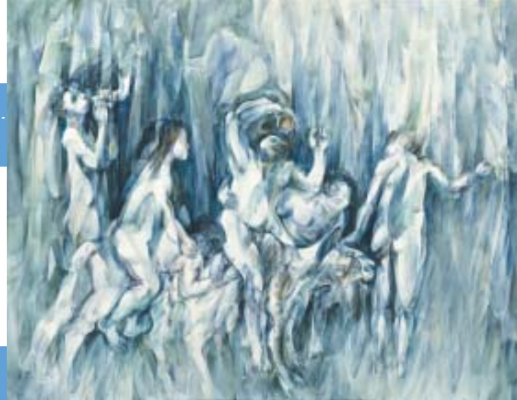
Louis le Brocqy, Children in a Wood I , 1988-89, oil on canvas, 114 x 146 cm, Courtesy of the artist

well as from works from public and private collections in Europe, Brazil and the US.