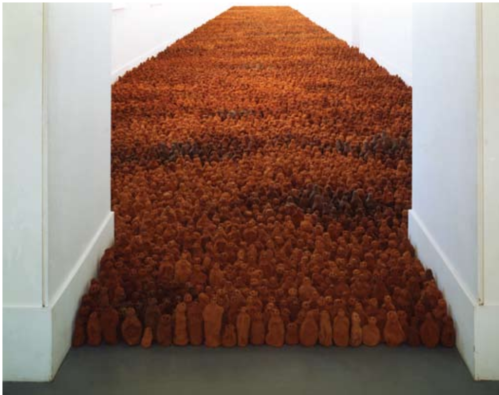
Image: Antony Gormley, Field for the British Isles, 1993.